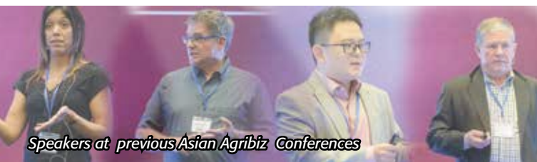
Speakers at previous Asian Agribiz Conferences